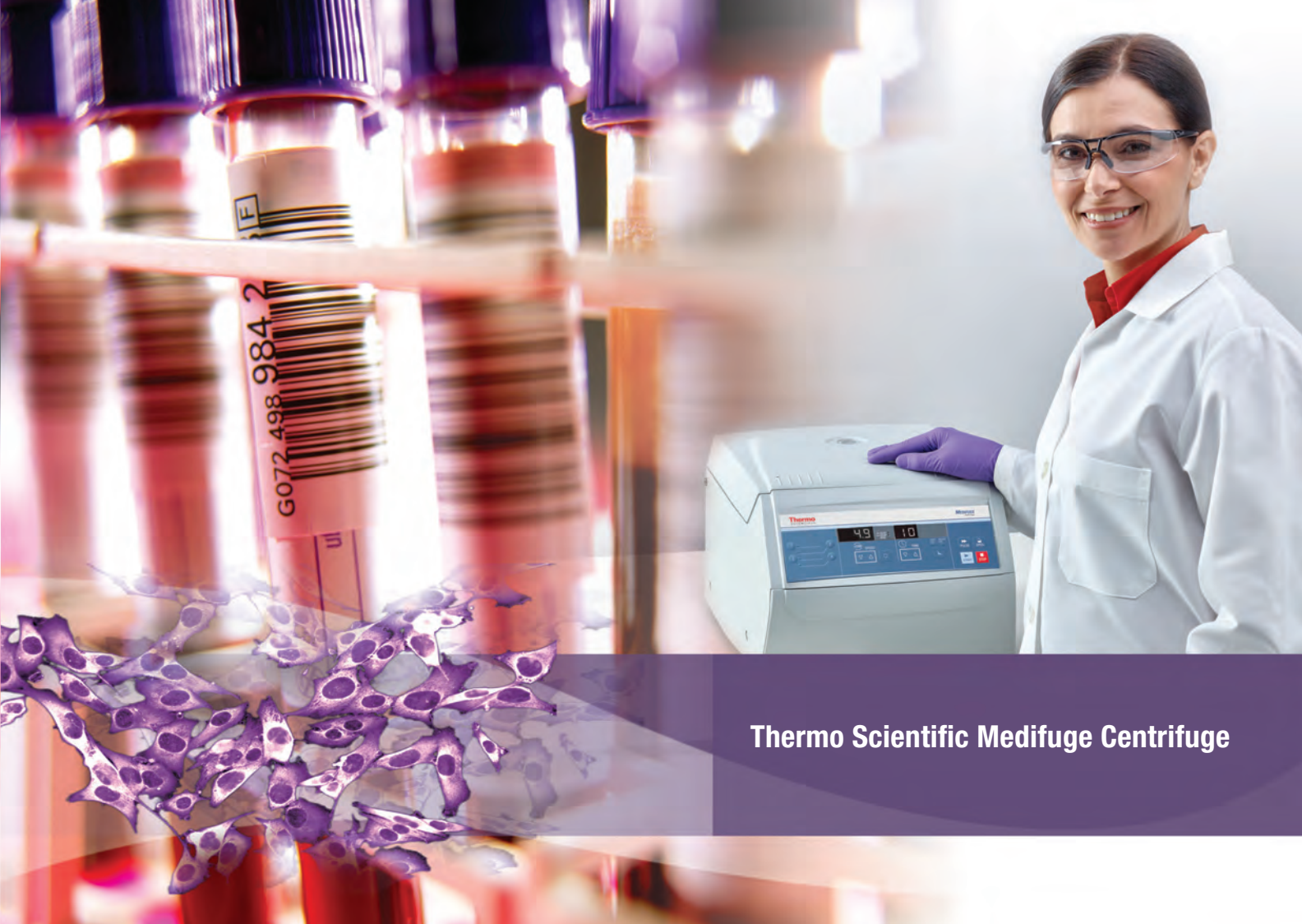
Thermo Scientific Medifuge Centrifuge