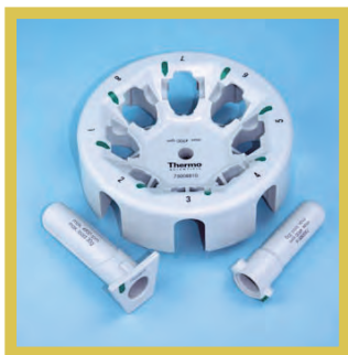
Unique DualSpin rotor with hybrid design