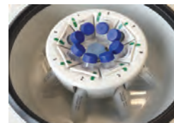
DualSpin rotor with fixed angle buckets