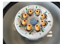
DualSpin rotor with swinging buckets