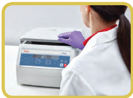
Fast one-click centrifuge lid closure