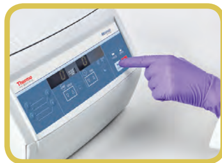
Large, brightly-lit display with intuitive controls